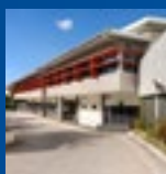
Sunshine Coast Haematology and Oncology Clinic 10 King Street Buderim QLD 4556