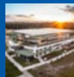
Vitality Village 5 Discovery Court Birtinya QLD 4575