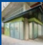
South Brisbane Building A1, SW1 Complex 32 Cordelia Street South Brisbane QLD 4101