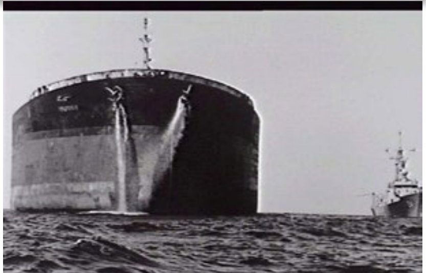
HMAS Darwin intercepting the Iraqi tanker Amuriyah suspected of flouting trade sanctions against Iraq; Australians boarded, searched and cleared the ship, October 1990.

In September, the Iraqis announced that: