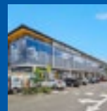
Health Hub Morayfield Level 1/19-31 Dickson Road Morayfield QLD 4506