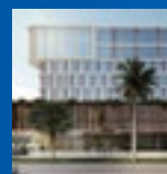
Maroochydore Private Hospital (under construction) Maroochydore City Centre Maroochydore QLD 4558